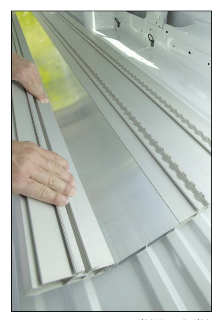
Click! Next profile - Click!